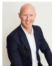
Dean Phillips 0359754555